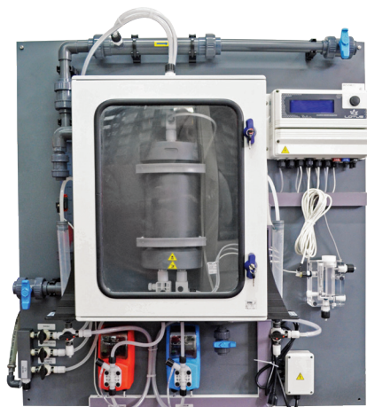
LOTUS MAXI from 80 to 240